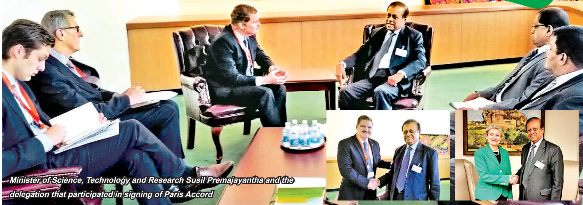
Minister of Science, Technology and Research Susil Premajayantha and the delegation that participated in signing of Paris Accord