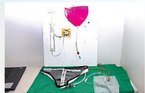
Special machine with catheter tubes and external bladder D.G.A.I. Jayarathna - Bronze Medal