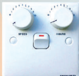
Automatic ceiling fan controller Prof. K.K.Y.W.Perera Gold Medal